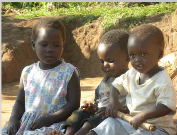
Ugandan children who are HIV positive.